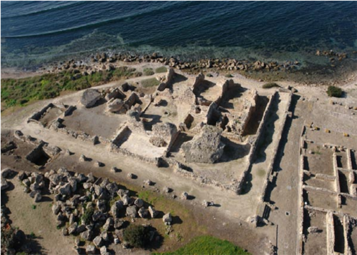
Fig. 3 - Nora, baths in Mare.