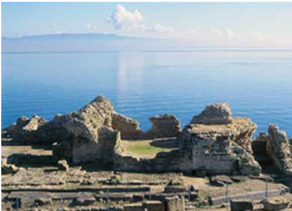
Fig. 4 - Tharros, baths in Convento Vecchio (from Acquaro-Finzi 2004, p. 55).