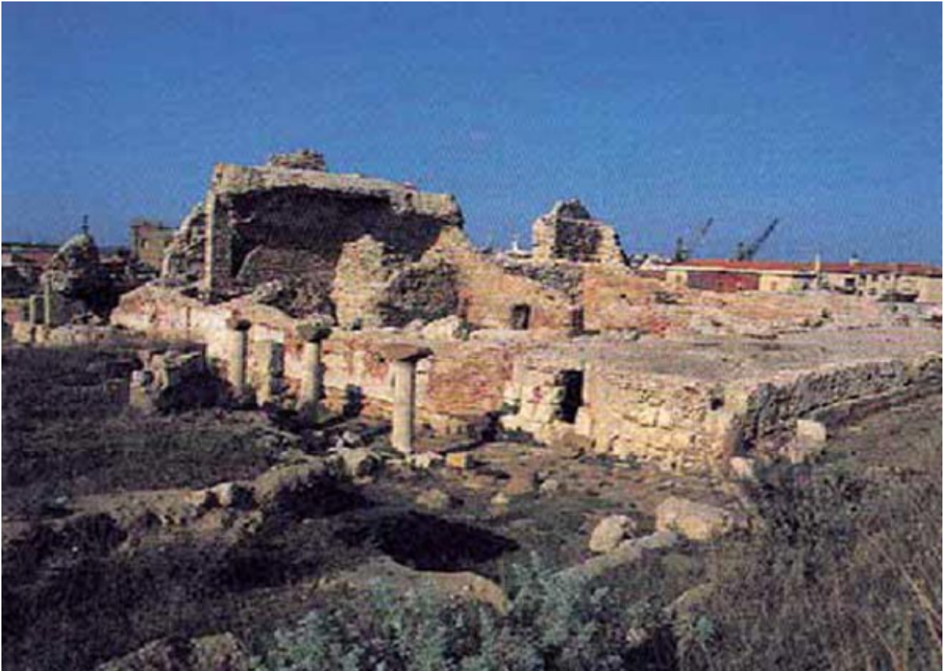
Fig. 2 - Porto Torres, baths so-called Palace of the Barbarian King (from Mastino-Vismara 1994, front)

There are two types of Baths in Sardinia: those that exploit the natural hot thermal waters (Fordongianus, Sardara), and those, more numerous, that use cold water after heating it. The baths are a constant element of the towns' urban aspects; they always have an important position (figs. 2-4), and are widespread in rural areas too, both as a part of villae, and as a qualifying element of small centres or village agglomerates.