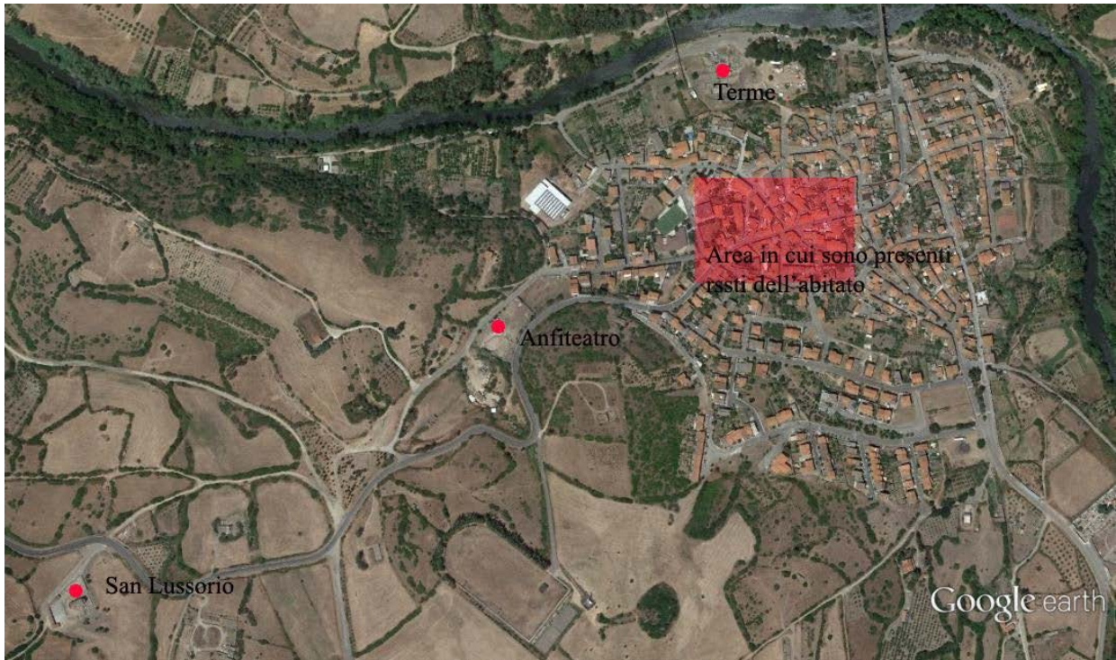
Fig. 2 - The territory of Fordongianus highlighting the most important sites (from Google Earth; reworked by C. Tronchetti).

They also found milestones belonging to other roads. Stretches of road were found near to the bridge over the Tirso; as were the remains of an aqueduct. Remains of urban roads and residential buildings (fig. 3) have also been identified here and there in the present town centre. At the start of the last century, some isolated tombs were found in the surrounding areas.