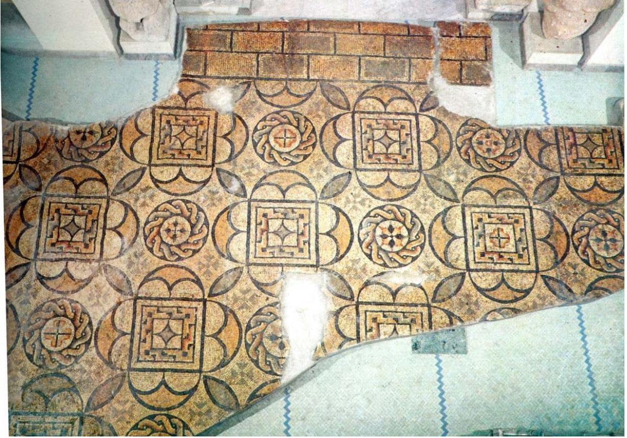
Fig. 3 - Mosaic floor found in Fordongianus (from Angiolillo 1981, tab. XLIV.)