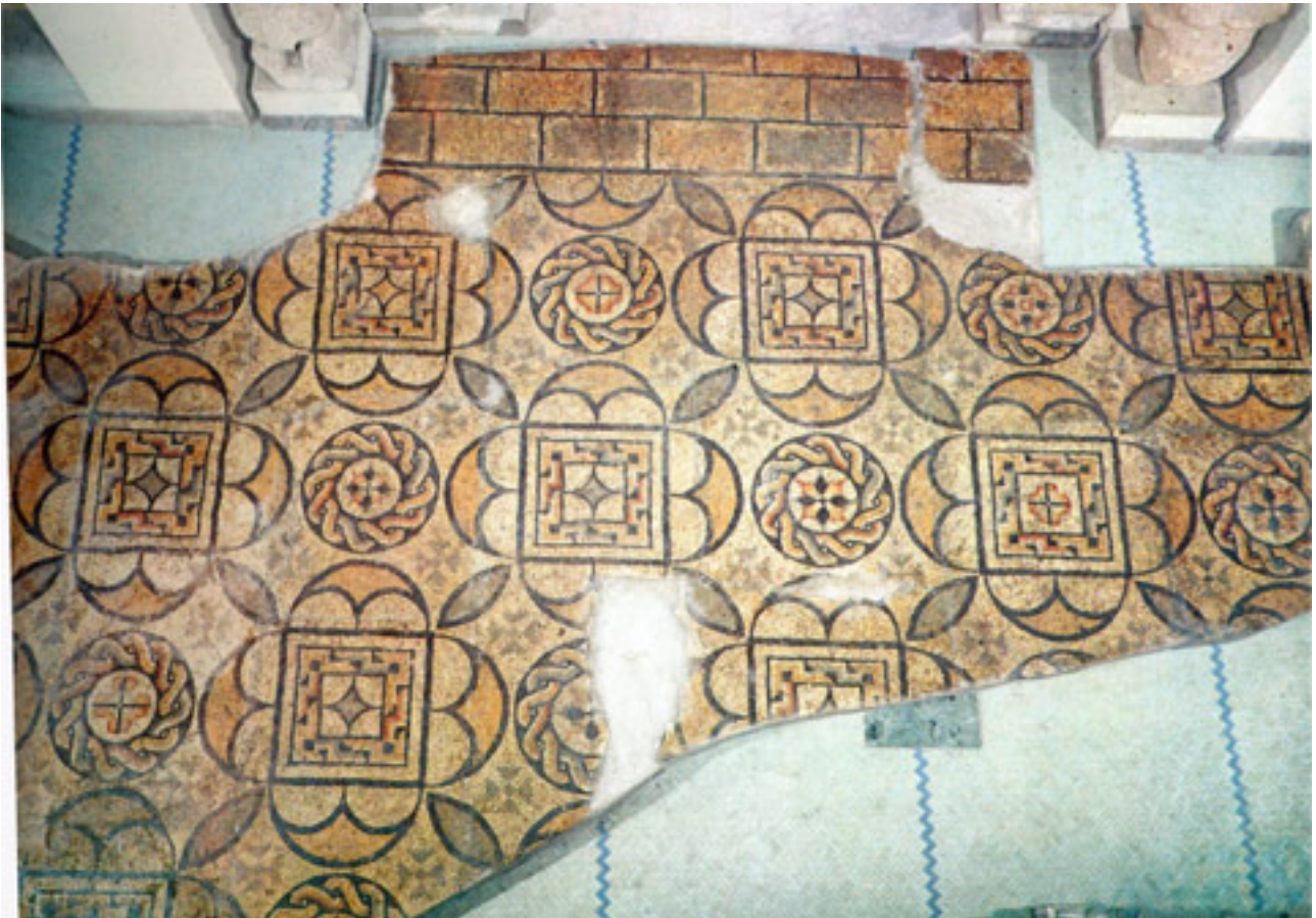
Fig. 1 - Fordongianus. Mosaic of a Roman house found under a modern house (end II-III cent. A.D.) (from Angiolillo 1981, tab. XLIV).

During some works carried out in a private residence in Via Vittorio Emanuele no. 16, they found a large, irregular fragment of a mosaic floor ( 9.15x3.40 m in maximum size, fig. 1).