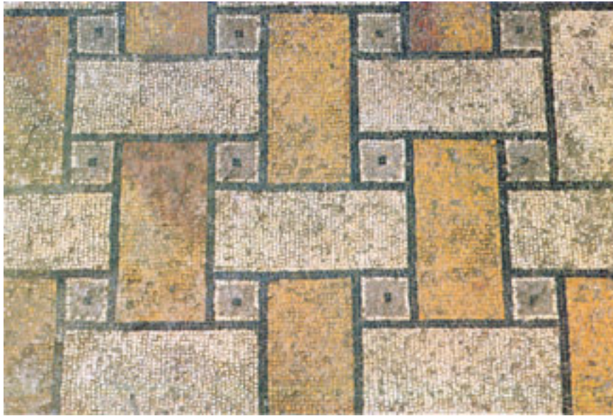
Fig. 4 - Porto Torres, Baths in the Palace of the Barbarian King (III cent. A.D.) (from Angiolillo 1981, tab. XLIV).