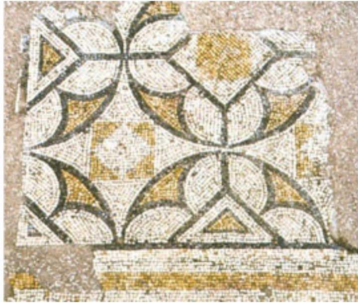
Fig. 2 - Porto Torres, Baths in the Palace of the Barbarian King (III cent. A.D.) (from Angiolillo 1981, tab XLV).

using African motives, datable between the end of the II and start of the III century A. D. The mosaic colours, played mainly on those of the earth, can generally be compared to the coeval productions of mosaics on the island, like examples found in the so-called "Palace of the Barbarian King" in Porto Torres and the so-called "Nymphaeum" in Nora (figs. 2-4).