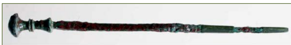
Fig. 5 - Nuragic dagger (PERRA 2012, fig. 6).

A bronze dagger with a moulded head, typical of the weapons of a Nuragic warrior and found in other meeting places, such as the sacred centre of Antas, near Fluminmaggiore, was found close to the nuraghe.