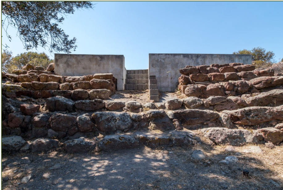
Fig. 5 - The tophet staircase.

Some steps lead to a ramp from the burial area (not the seven of the scenographic monumental staircase, reconstructed in the 1960s digs: fig. 5 which must be replaced by a new one),