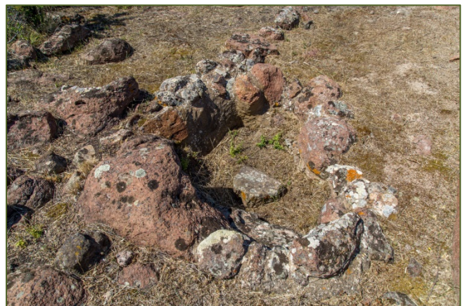
Figs. 6, 7 - Rooms and fireplaces in the tophet sanctuary.