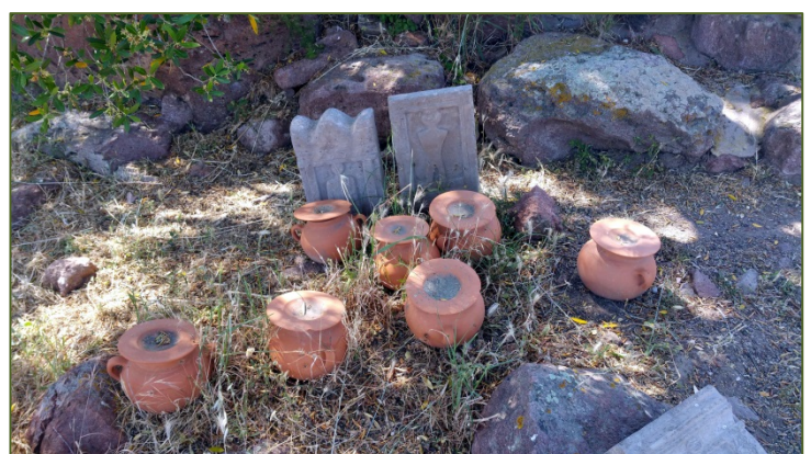
Figs. 3, 4 - Map of the tophet with distribution and types of urns (GUIRGUIS 2013, fig. 7); reproductions of urns and stelae of the tophet at Monte Sirai (photo MANCA DI MORES 2015)