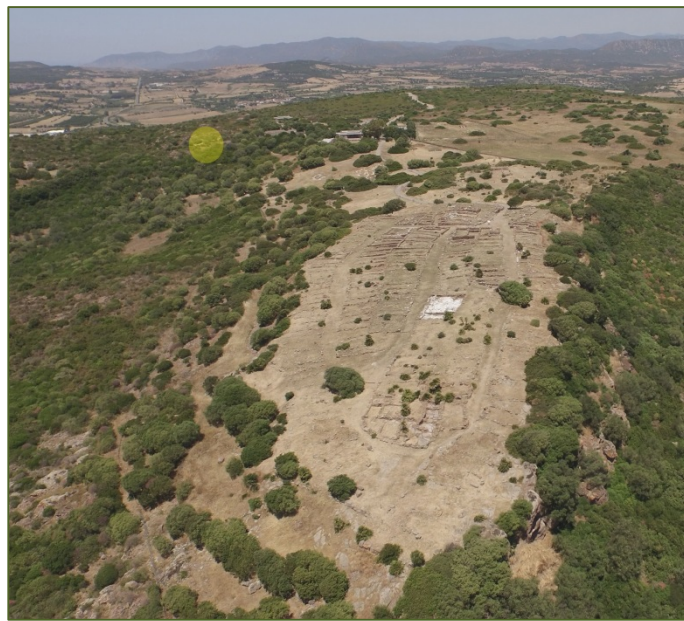
Fig. 1 - The settlement of Monte Sirai. Highlighted the position of the tophet.

The tophet, the Phoenician sanctuary reserved for deceased infants (by periodical sacrifice according to some experts, while according to others they were babies born prematurely or aborted: however, in any case, the ceremony includes a purification sacrifice using fire) is proof of the urban culture and a growing population in the area, that involved Monte Sirai at the edge of the residential area, as in Phoenician town traditions (fig. 1).