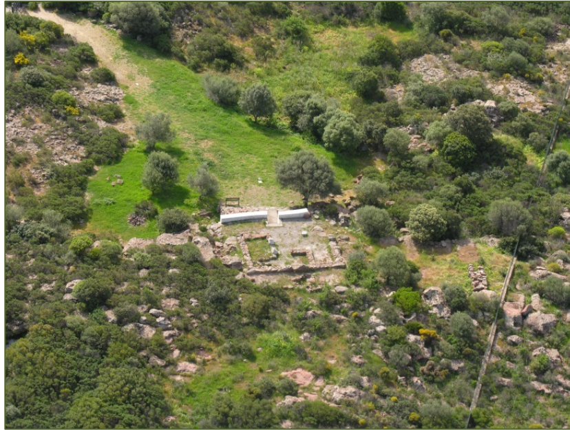
Fig. 2 - The area of the tophet (GUIRGUIS 2013, fig. 7).

The sanctuary included a burial area where sophisticated urns containing the deceased children's ashes were covered by plates and placed in the ground (about four hundred have been found: fig. 3), with a sign (but not for all) comprising a stone stela of various types and symbols: Sometimes Egyptian style, others in Greek style or more linear, sometimes inside sacelli or tabernacles that were copies of temple architecture.).