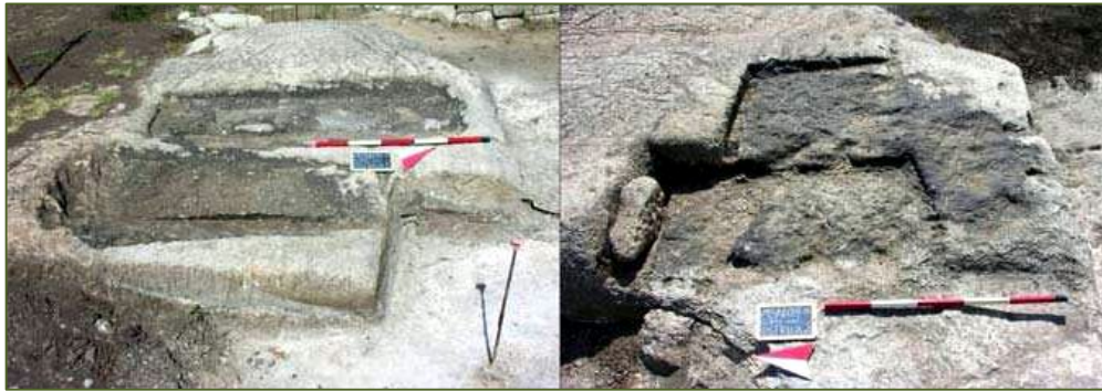
Fig. 3 - Sectors arranged as collective ustrinum (GUIRGUIS 2012, fig. 6).

From a historical and cultural point of view, it is therefore possible to hypothesise the presence, at the same time as the Carthaginian centres linked to chamber tombs dug into the rock, of other populations and social classes: some of them, partly natives, are still linked to previous Phoenician traditions. The site was also frequented in very ancient times, as levels relating to the Sardinian eneolithic culture of Monte Claro have also been found not far from the Punic necropolis (that would also show a special approach to allocation of tombs on high ground).