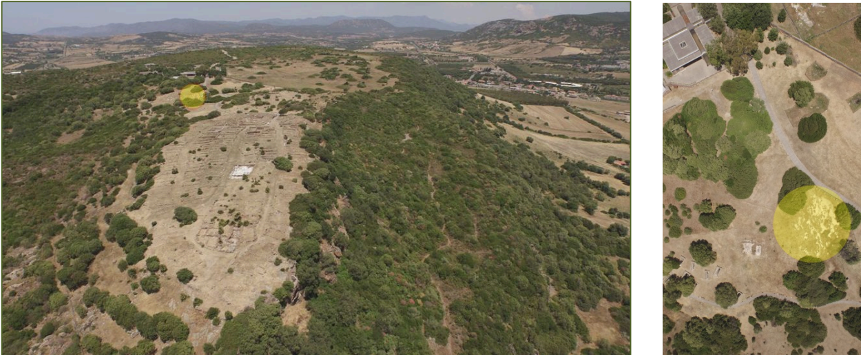
Figs. 1-2 - The Phoenician necropolis area (highlighted)

The Phoenician necropolis, dated between the end of the 7th century BC and the following century, comprises a group of older tombs that have been documented on Monte Sirai.