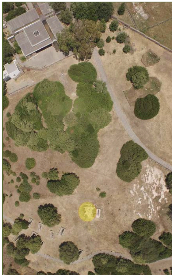
Fig. 1 - Aerial view of the hypogeum necropolis.

Tomb no. 1 is in the eastern part of the hypogeum necropolis, alongside tomb no. 2. Further east is the cremation necropolis (fig. 1). The layout of the monument, that shares the general one used in the necropolis and is dug into a bank of tufa rock, has an entrance all, known as a dromos , that leads to the burial chamber (fig. 2). The tomb belongs to the period of the Carthaginian conquest, which the hypogeum necropolis is a burial space for, between the 5th and 3rd century BC.