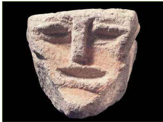
Fig. 4 - The head originally sculpted on the ceiling (GUIRGUIS 2013, fig. 47).

Unfortunately, the intervention of illegal diggers, who were also able to work widely on Monte Sirai, made the sculpted head from the ceiling fall off, which was fortunately recovered and kept in the National Archaeological Museum in Cagliari.