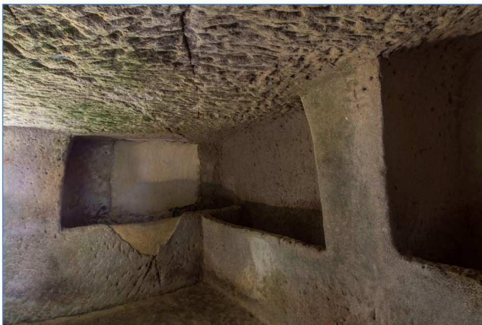
Fig. 4 - Sarcophagus dug out from the rock in tomb '5'

They are distinguished by the use of pillars and for figured and symbolic decorations (such as masks in relief on the ceilings, or a sign of the goddess Tanit, turned upside down, on a pillar in tomb no. 5 (fig. 4). The items in sarcophagi cut into the rock (fig. 4), niches and unfortunately vanishing traces of red paint.