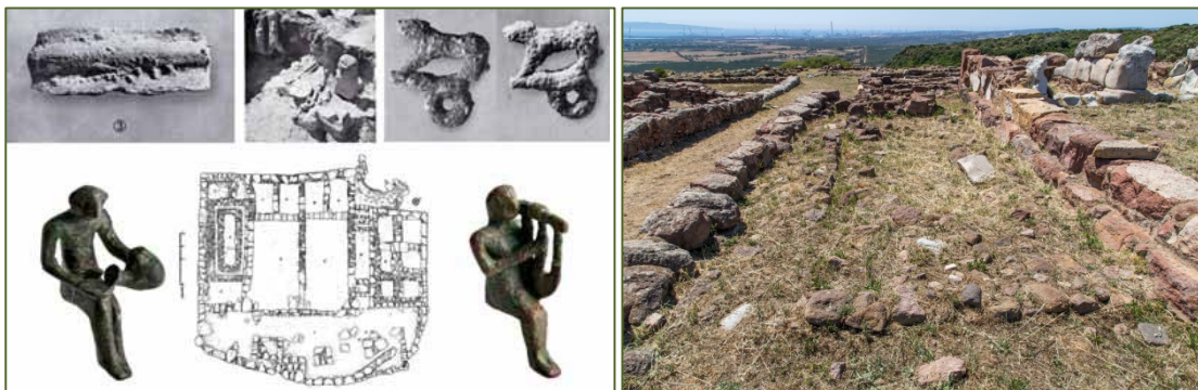
Figs. 3, 5 - The settlement of Monte Sirai: highlighted the "temple of Astarte". (BARTOLONI 2004, fig. 11; drawn up by GUIRGUIS 2013, fig. 11)

Nuragic and Phoenician bronze statues refer to this phase; one of them, the symbol of the well-known meeting between Phoenicians and Nuragic people in Sardinia (stated to have taken place a short distance from the Sirai nuraghe) shows a libation with a pitcher similar to the askoid Nuragic ones (figs. 5-6).