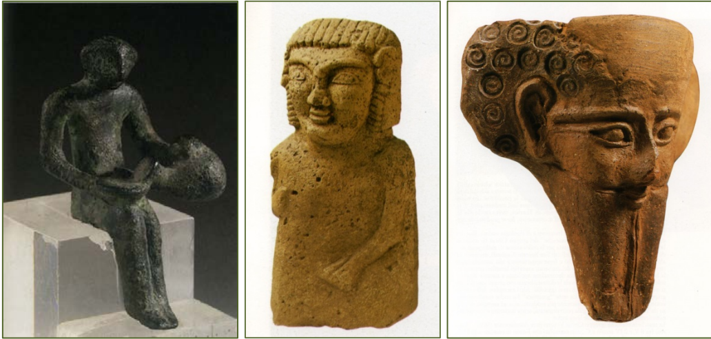
Figs. 6, 8 - Phoenician bronze statue (MOSCATI 1988b, p. 427) ; statue of Astarte (MOSCATI 1988b, p. 286) ; Egyptian-style protome (MOSCATI 1988, p. 362)

Following the Nuragic and Phoenician period, there was an episode (general on the site) of destruction and reorganisation, attributed to the Carthaginian conquest in the final decades of the 6th century BC: materials from the Late Antique age and the 5th century BC, such as masks, protomes (fig. 8), Attica ceramics with black figures and a possible reworking of the statue all refer to this period.