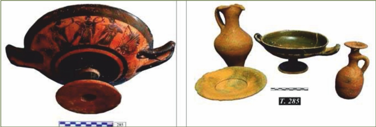
Fig. 3 - Items from tomb 266, with the Attica kylix with black figures (from GUIRGUIS 2012, fig. 8).