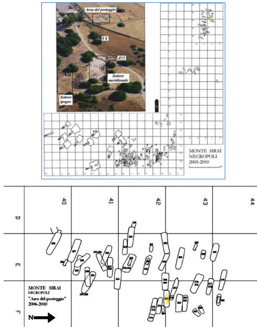
Fig. 1, 2 - Image of the Phoenician necropolis and location of tomb 266 (GUIRGUIS 2011, figs. 3-4).

Tomb 266 is part of the burial area known as “the car park necropolis” (figs. 1-2) and is in the eastern sector. This is an inhumation burial tomb, where the ceramic items accompanying the deceased, a young woman, include a typical Punic set: two pitchers (one with a mushroom rim, the other bilobed), two plates with a centre mound and a beaker, with red paint decoration and painted lines (fig. 3). These are Phoenician items that were used until the 5th century BC. The items here belong to the early part of that century. A small jewel was found close to the skull. A silver pendent in the form of a miniature ring.