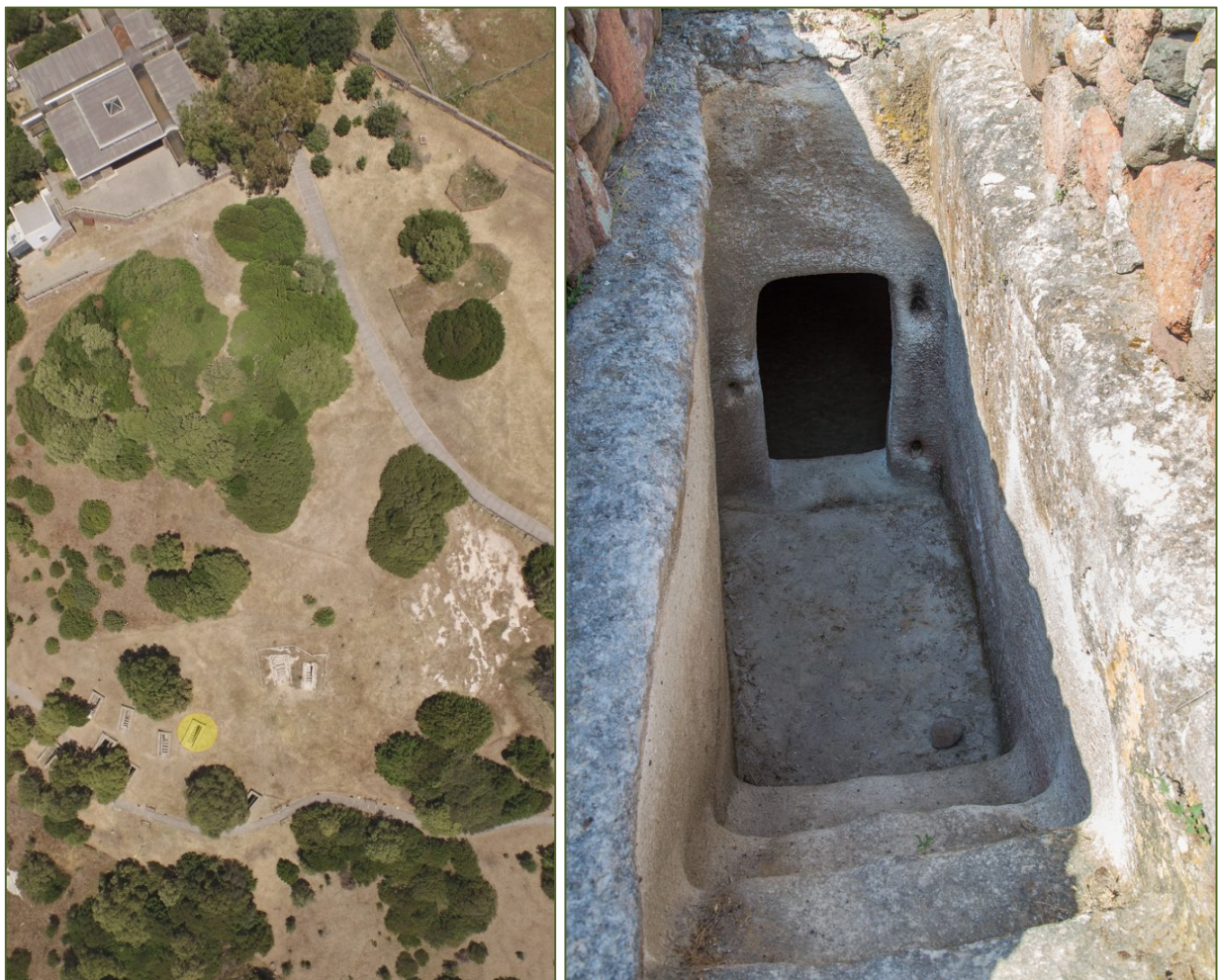
Figs. 1, 2 - Aerial view of the hypogeum necropolis and entrance corridor to tomb 10.

The entrance, at the end of the usual access corridor (named dromos ) with steps (figs. 1-2), is on one of the long sides, like in tombs 2, 4 and 8 of the same necropolis.