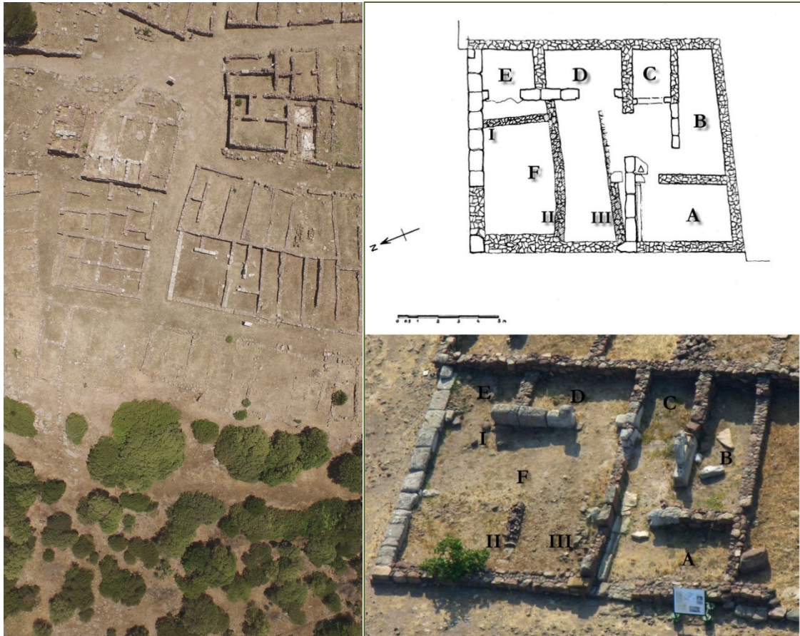
Figs. 3, 4 - The 'casa Fantar' (GUIRGUIS 2013, fig. 19).

It is a dwelling with a courtyard, with five rooms and an entrance hallway, probably built on two floors (figs. 3-4). A small room near the entrance was probably a store-room or a workshop-shop.