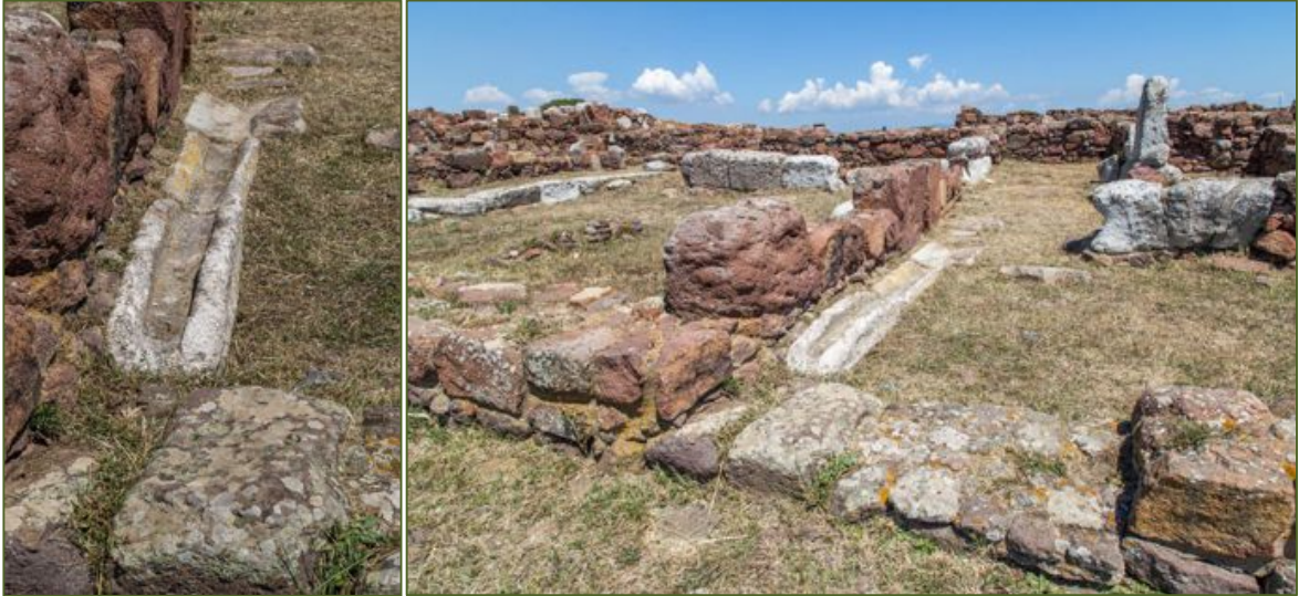
Figs. 5, 6 - Limestone channel and its connection with the road.

The use of large square blocks in supporting walls is also significant (fig. 7).