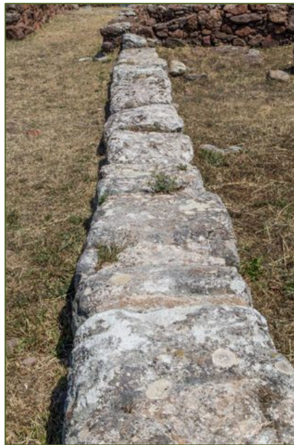
Fig. 7 - Supporting wall in square blocks.

The use of large square blocks in supporting walls is also significant (fig. 7).