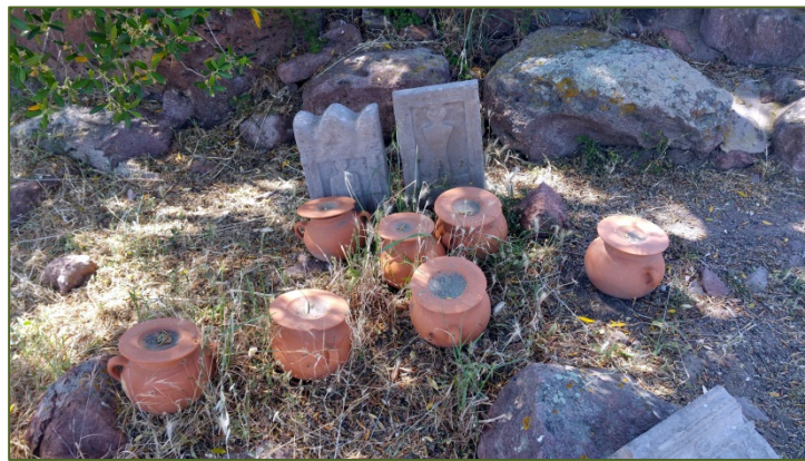
Fig. 5 - Reproductions of urns and stelae from the Monte Sirai tophet

The current arrangement of the site has some copies of the urns and stelae (fig. 5). A reconstruction of the “field of urns” offered by the Nuovo Museo Civico Archeologico Villa Sulcis in Carbonia.