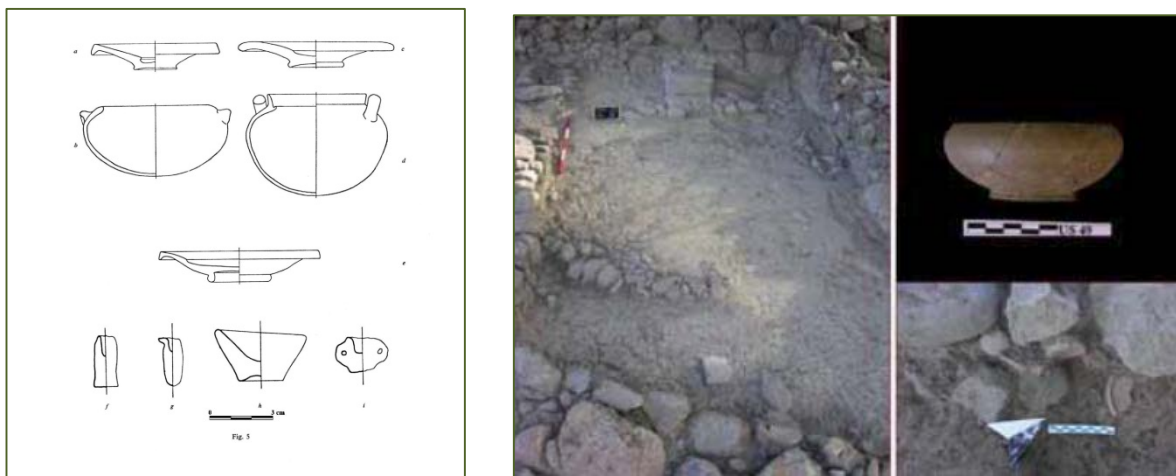
Figs. 1, 2 - Ceramics from the tophet (BARTOLONI 1982, fig. 5); context 2nd century B.C. Of the dwelling area, area C64 (GUIRGUIS 2013, fig. 24).

In the necropolises found and investigated on Monte Sirai, this time phase is still not frequently represented, although development of research must find a higher number, given the urban documentation and timeline of the tophet (figs. 1-2), therefore identifying tombs from the community that lived on Monte Sirai in those two and a half centuries.