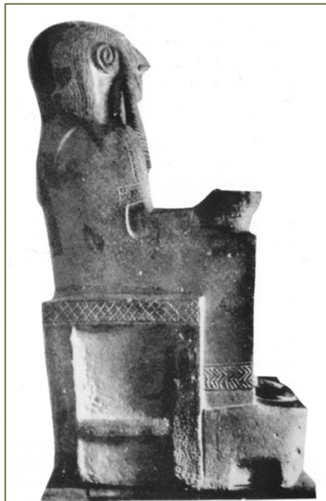
Fig. 5 - Syria. Tell Halaf. The "Great Goddess" (MATTHIAE 1997, p. 195).

which brings about the hypothesis of local production at the times of the early Phoenician presence on Monte Sirai.