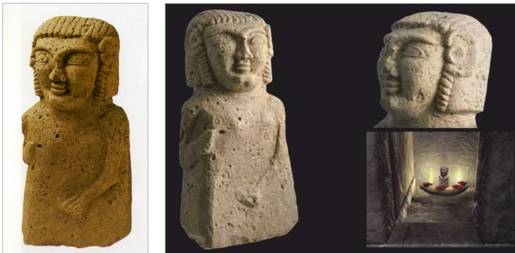
Figs. 1, 2 - Statue of Astarte from Monte Sirai (MOSCATI 1988b, p. 286); hypothesis of the return of the sacellum with the statue of Astarte (GUIRGUIS 2013, fig. 16)

The cells were dated to the neo-Punic phase of the temple (fig. 2) but the item dates back at least to the 7th century BC.