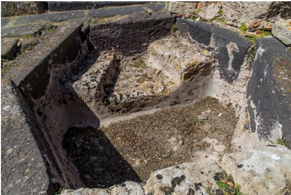
Fig. 5 - Detail of the baptismal tub chair

Inside the tub there is the seat for the person being baptised, built in concrete (fig. 5).