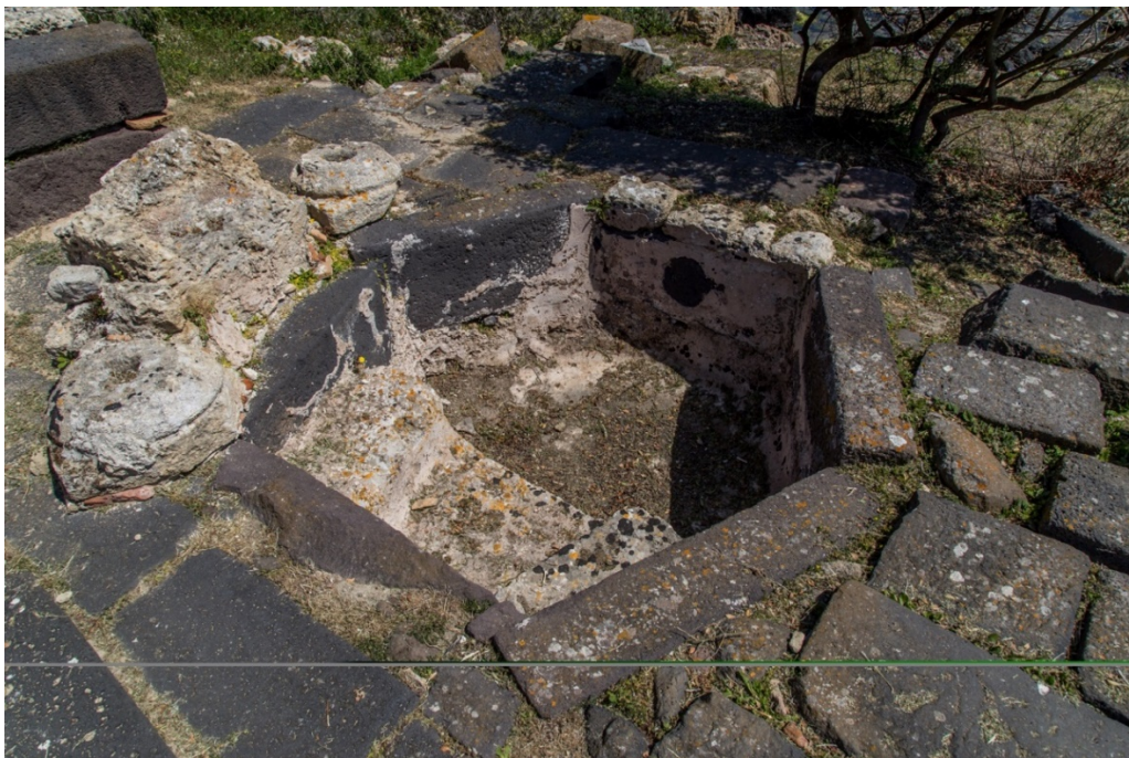
Fig. 3 - The baptistery from the 6th century AD

The structure destined for this liturgy also had an apse to the North-east and contained the hexagonal baptismal tub (fig. 3).