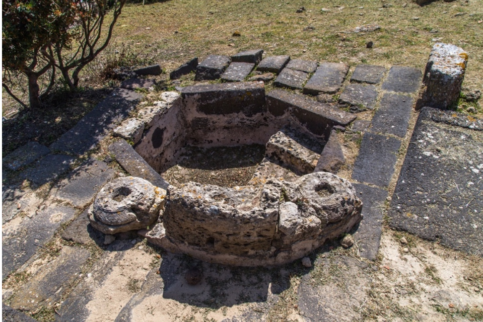
Fig. 4 - The remains of the baptismery canopy

The tub must have been covered by a canopy, as seen by the springers of the two columns on the northern side (fig. 4).