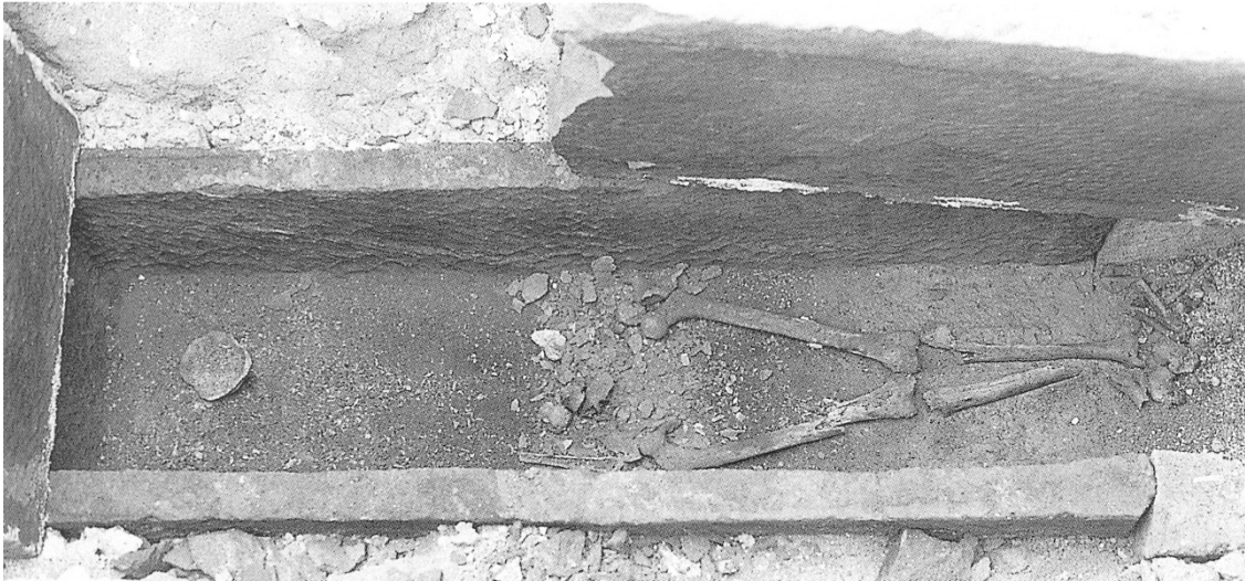
Fig. 3 - The sarcophagus with the remains of the deceased

All the other toms, which are mostly in the northern part of the moat, are cupae, i.e. With a semi-circular covering (figs. 4-6).