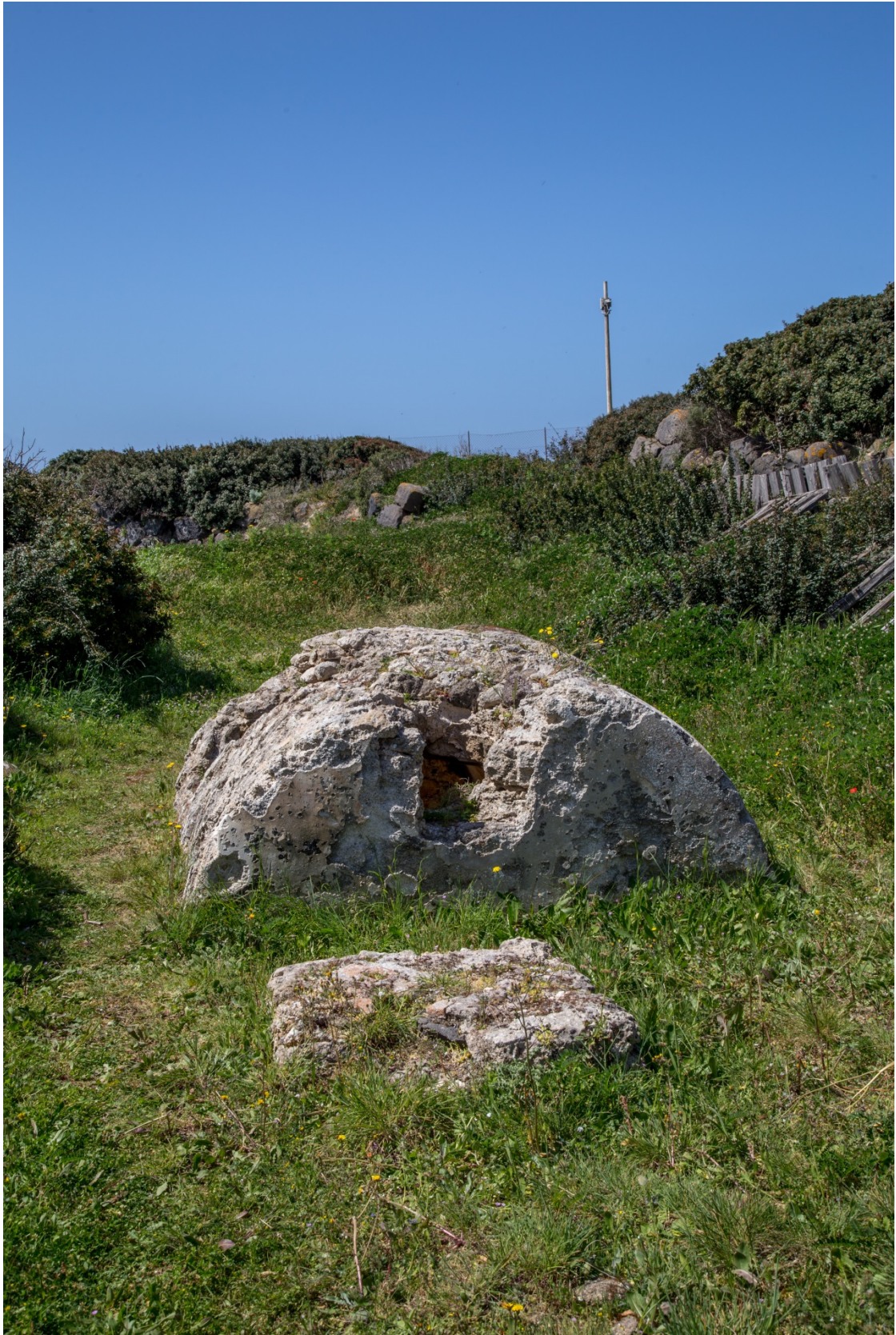
Fig. 8 - Cupae tomb with the mensa opposite