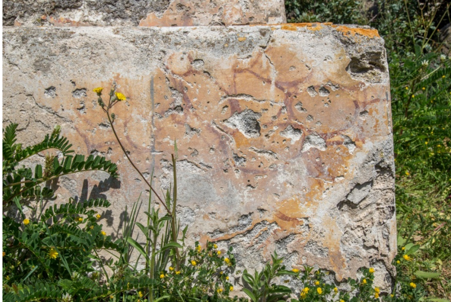
Fig. 7 - Decoration painted as marble.

Sometimes, these tombs were painted with figures that imitated the marble crustae (fig. 7); in some cases there was a table opposite the tomb where a symbolic holy meal was kept in honour of the deceased person (fig. 8).