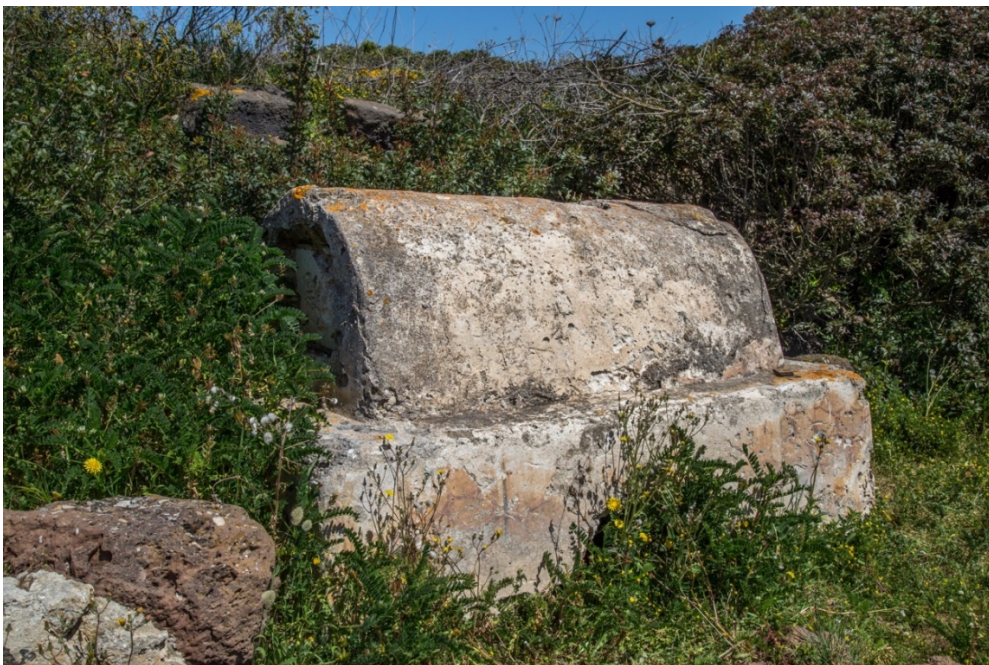
Fig. 6 - Cupae tomb in the moat in Tharros