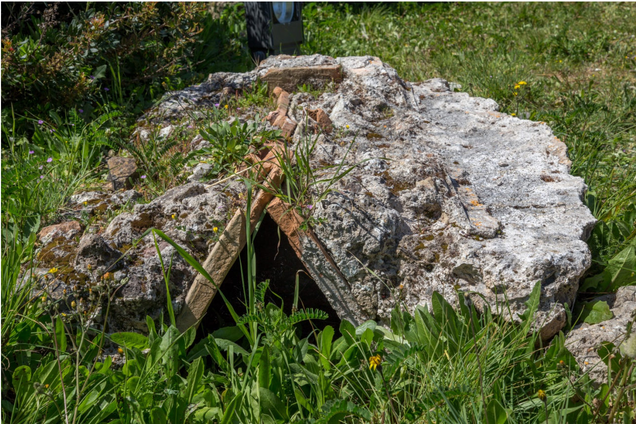
Fig. 9 - Capuchin tomb incorporated into the cupae tomb.

The cement mound covered in plaster contained the tomb that could either be capuchin (fig. 9) or a simply stone box.