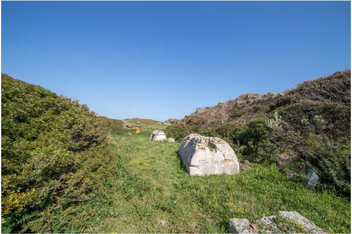
Fig. 5 - The necropolis in the moat