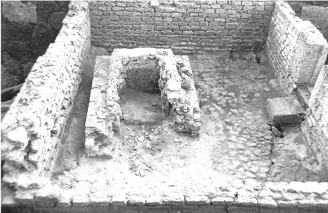
Fig. 2 - The small mausoleum in the moat

The most visible element in this burial area was a small mausoleum with a boundary of stone blocks and flooring of rough stones, where a violated mound tomb above a small stone sarcophagus was found. The small monument is dated to the final decades of the 1st century A.D. (figs. 2-3).