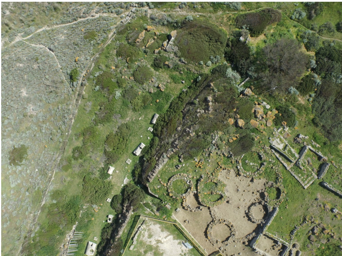
Fig. 1 - The necropolis in the moat on Su Muru Mannu.

A small necropolis from the early Imperial Age developed inside the moat that was partly filled in in 50 B.C. on the hill of Su Muru Mannu.