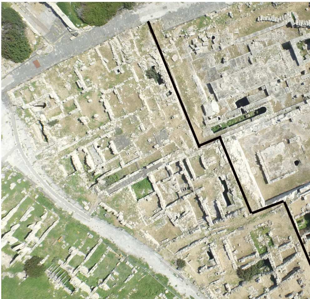
Fig. 1 - blocks of houses in the central quarter. The black line separates the public area where places of worship were located (photo by Unicity S.p.A.). Reprocessed by C. Tronchetti)

The houses were mainly in the western part of the central quarter (fig. 1) and on the eastern slop of the hill of San Giovanni (fig. 2).