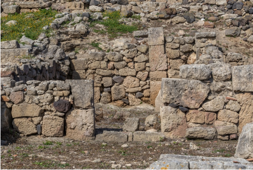
Fig. 7 - House probably belonging to type 4 of fig. 5

Like most dwellings in Roman cities, the houses had a second floor or a gallery paved in wood; in some cases, existence is proven by the cavity in the walls, that held the beams supporting the floors (fig. 8).