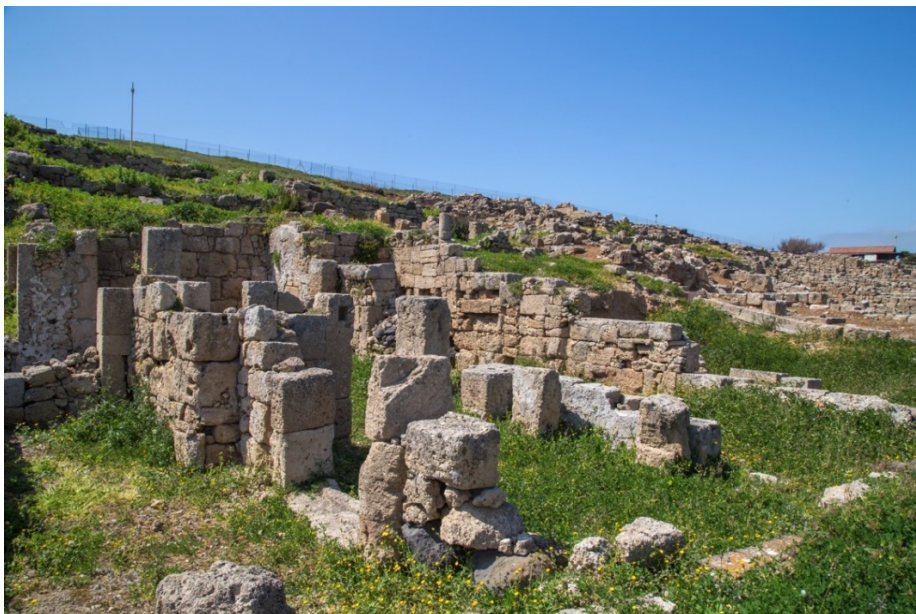
Fig. 8 - Roman house; the cavities for the beams supporting the gallery floor can be seen on the back wall

Like most dwellings in Roman cities, the houses had a second floor or a gallery paved in wood; in some cases, existence is proven by the cavity in the walls, that held the beams supporting the floors (fig. 8).