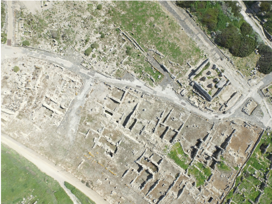
Fig. 2 - The housing quarter on the slopes of San Giovanni hill.

The special geomorphological situation of the land affected the layout of the homes, placed on terraces of a steep slope (figs. 3-4), as an obligatory solution for arranging the houses.