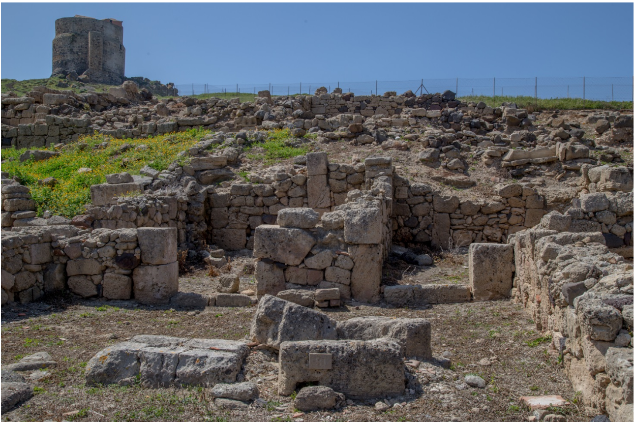
Fig. 6 - House belonging to type 2 of fig. 5