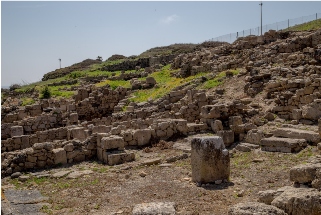
Fig. 3 - Houses on the slope of San Giovanni hill