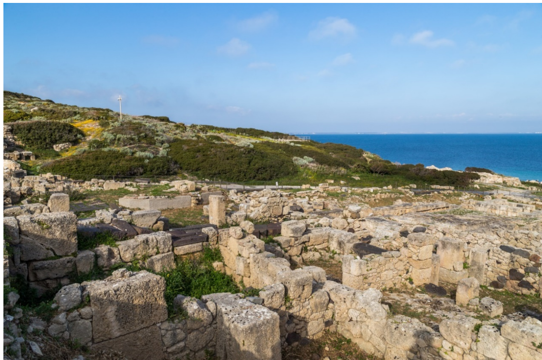
Fig. 4 - Houses in the central area