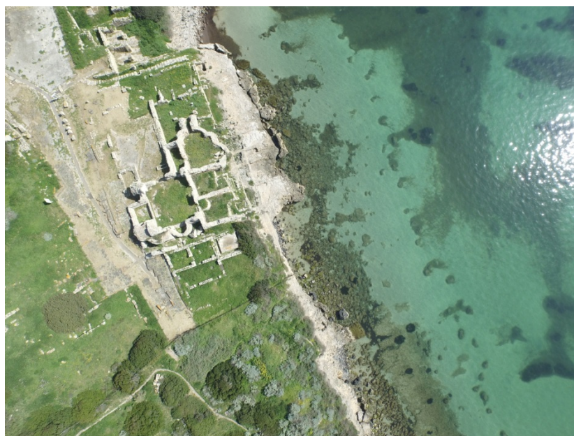
Fig. 2 - The Convento Vecchio thermal baths