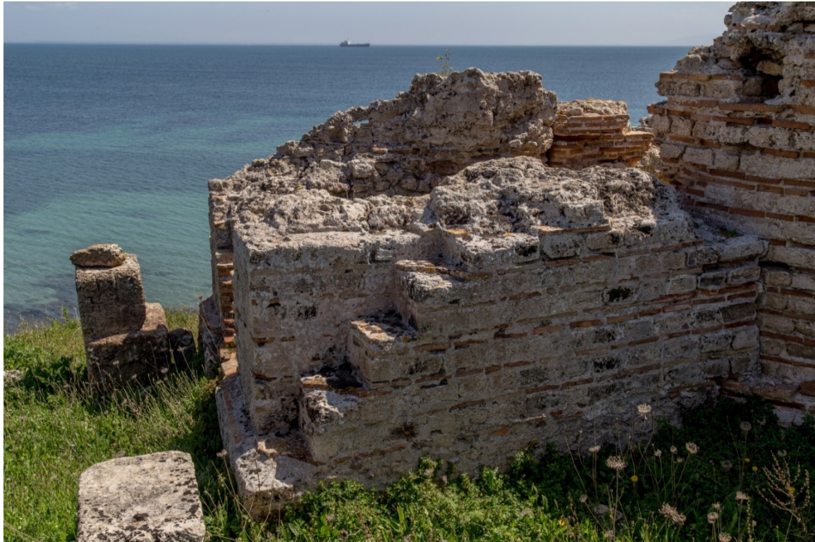
Fig. 9 - External part of a heated room, with the staircase to access the cisterns above the building roof

The heated rooms were reached through here, on the eastern side of the building. Unfortunately, the erosive action of the sea caused the land that this part of the building stood on to deteriorate, and thus it collapsed, therefore reconstruction cannot be made in detail. It is certain that there were three adjacent rooms, one of which still has a praeefurnium (figs. 9-10).