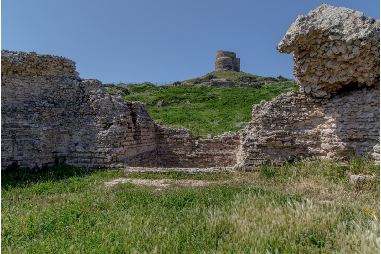
Fig. 7 - Rectangular tub in the frigidarium