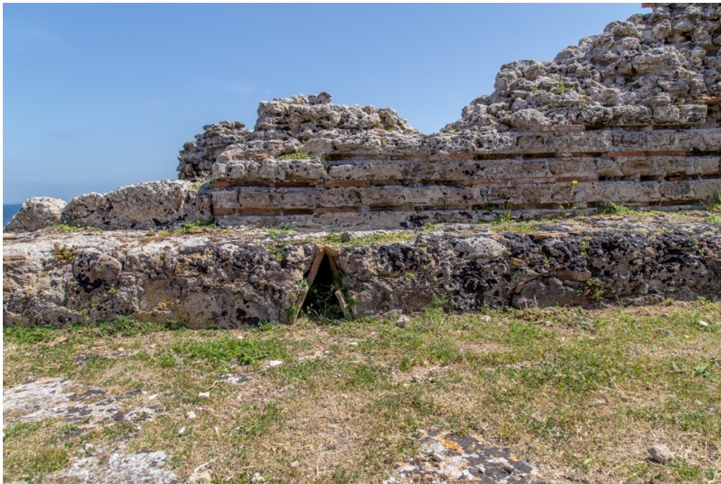
Fig. 6 - Apodyterium bench, with the locker for holding clothes

From the large apodyterium (fig. 6) one moves into the frigidarium , with two small tubs, one semi-circular one and the other rectangular (figs. 7-8).