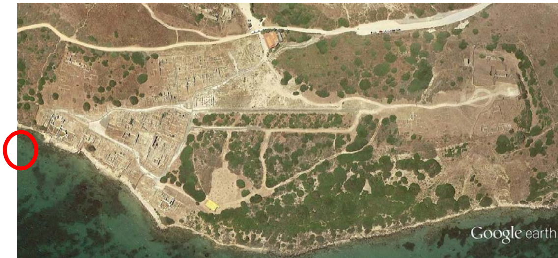
Fig. 1 - Location of the Convento Vecchio thermal baths

The Convento Vecchio Thermal Baths, located on the eastern coast towards the Gulf of Oristano (figs. 1-3) probably take their name from the use of structures in the Late-ancient era as the site of a small convent for monks, the only evidence of which may be a Byzantine era tomb found in the apodyterium (fig. 4).