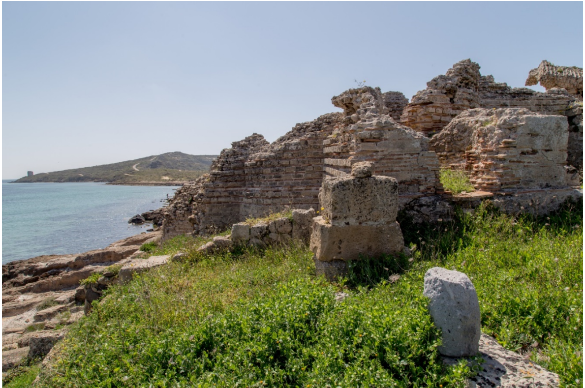
Fig. 10 - Praefurnium of a heated room

The route then led back to the frigidarium via a small room to be passed through. A large cistern for water was located in the south-west part of the frigidarium , but only the base that stood on the floor of the room remains.