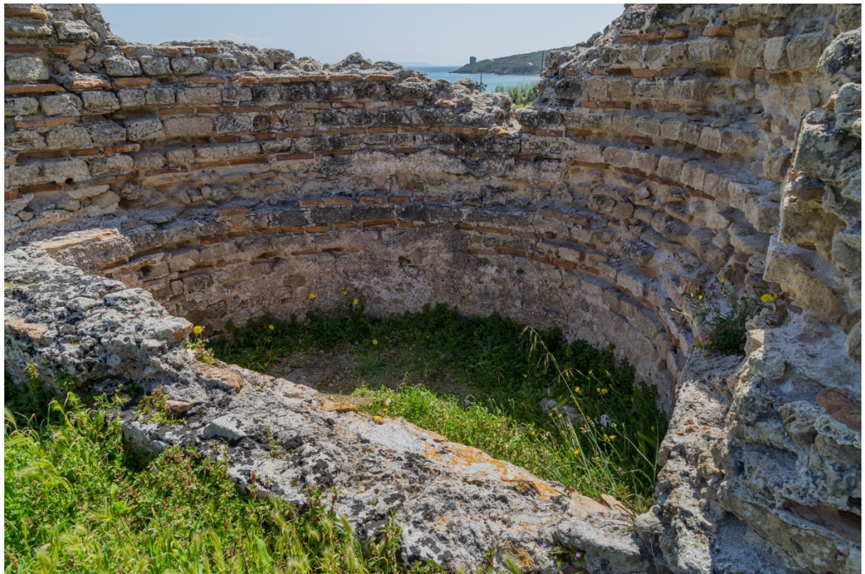
Fig. 8 - Semi-circular tub in the frigidarium