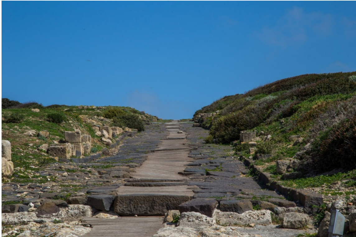
Fig. 3 - Main N-S road; the trace of the Roman sewer in the centre, currently covered in wood for safety reasons