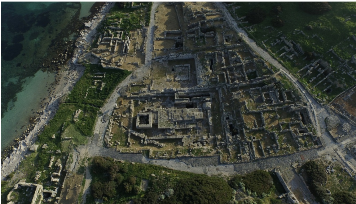
Fig. 2 - The roads that divide the central quarter of Tharros