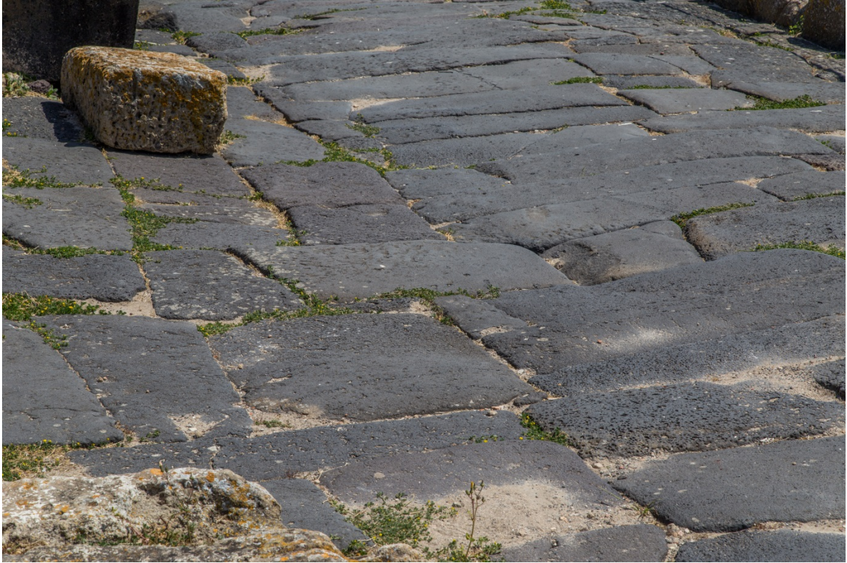
Fig. 5 - Road paving

The paving of the roads (fig. 5) seems due to an intervention to organise the urban centre, that we cannot date, but that, according to a similar phenomenon found in Nora, can be hypothesised between the 2nd and 3rd century A.D.