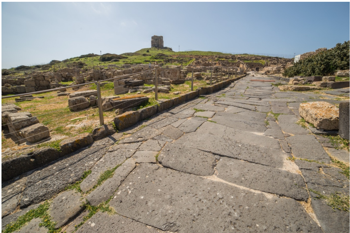
Fig. 4 - Main W-E road