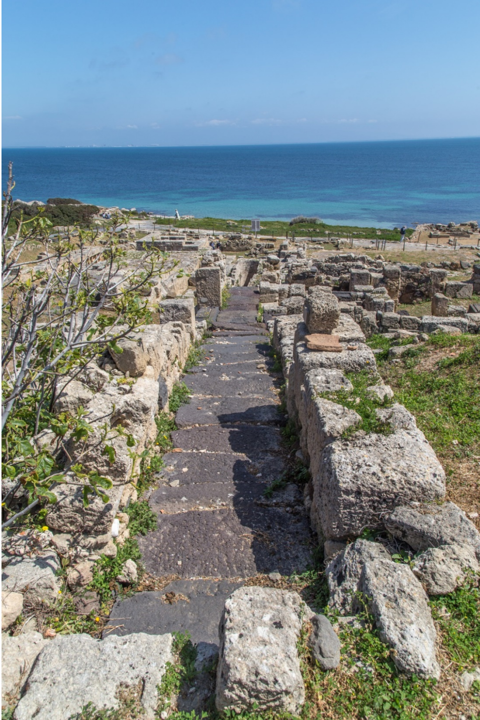
Fig. 6 - A narrow ambitus that outlines the blocks of houses

The small roads on the hill also had a sewer that offloaded into the sewer system of the main streets.