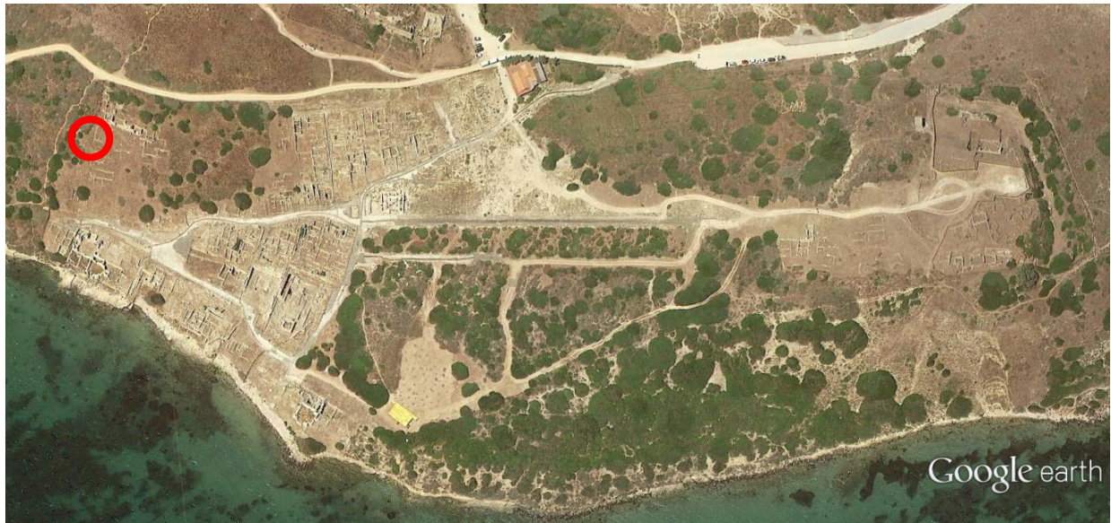
Fig. 1 - Location of the temple of the inscriptions

Halfway up the western side of the San Giovanni hill, which is dominated by the tower of the same name, there is a base in sandstone blocks supporting a small temple, known as temple K, and a portico (figs 1-3)