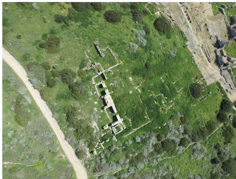
Fig. 2 - The area of the temple of the inscriptions"