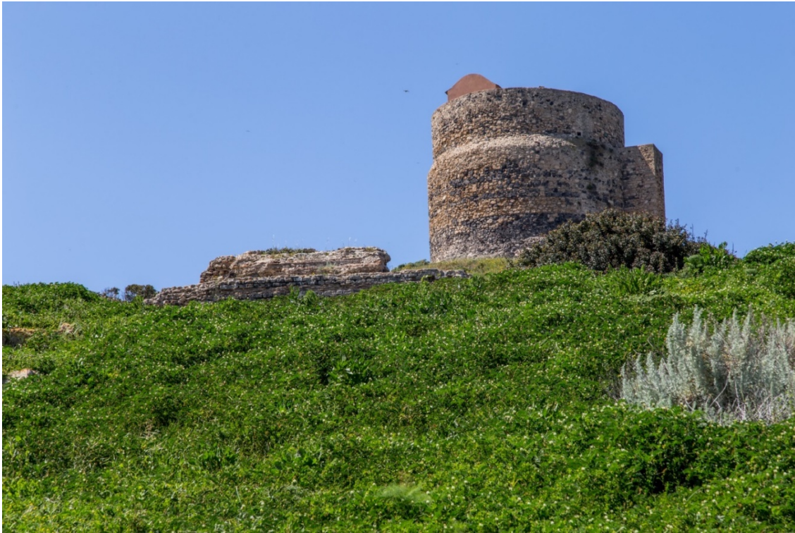
Fig. 3 - The remains of the temple of the inscriptions on the slopes leading up to the Torre di San Giovanni

The temple K is small, rectangular, and accessible from a small staircase of five steps, and had two in antis pillars on the front (figs. 4-5).