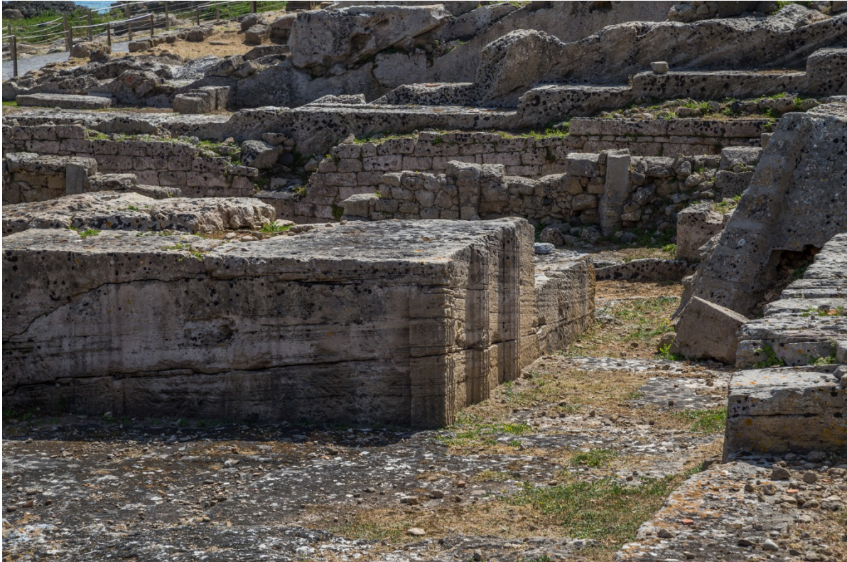
Fig. 5 - The temple of semi-columns; details of the relief work on the columns