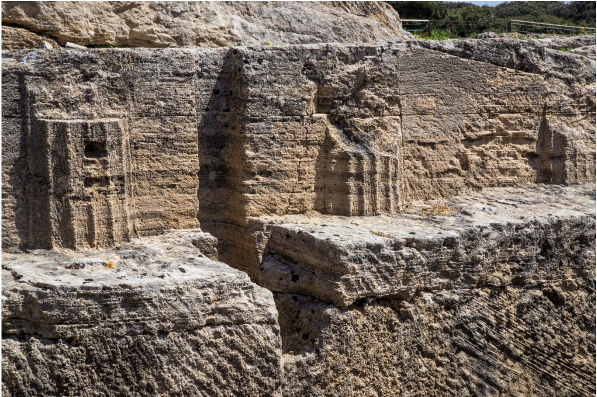
Fig. 6 - The temple of semi-columns; details of the relief work on the columns