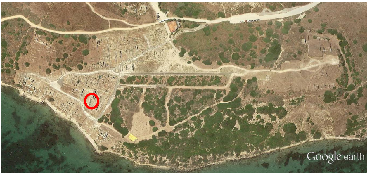
Fig. 1 - Location of the temple of semi-columns (from Google Earth. Reprocessed by C. Tronchetti)

The most important and significant evidence of Punic Tharros remaining is the so-called temple of semi-columns" (figs 1-3).