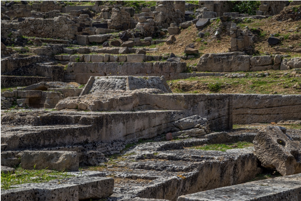
Fig. 4 - The temple of semi-columns