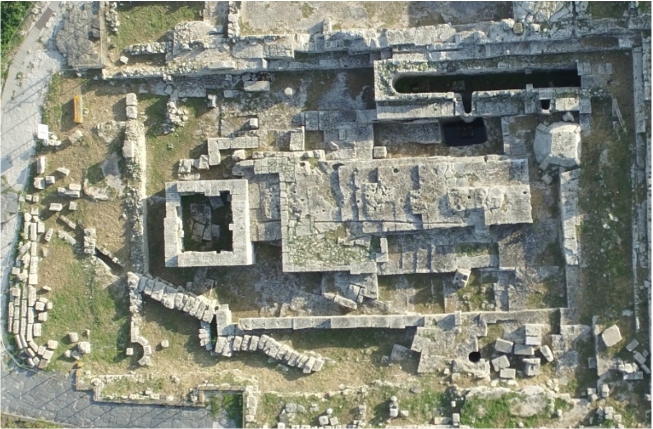
Fig. 3 - The temple of semi-columns; left, the remains of a Roman structure; top the large cistern

The name was allocated by the digger Gennaro Pesce, due to the special construction technique of the structure. In fact, the base of the temple was made from the rock "by lifting", until a terraced podium was formed. Using the same technique, the two long walls and the back wall were decorated with semi-columns in relief work (figs- 4-7).