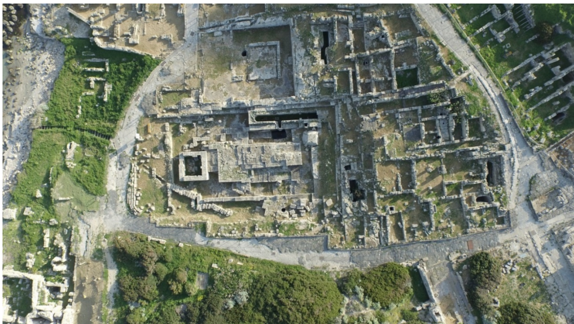
Fig. 2 - The semi-column temple from above