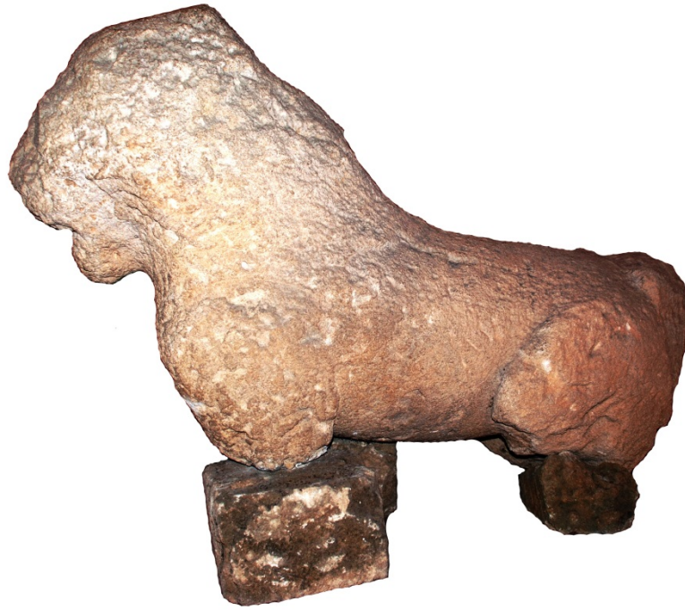
Fig. 9 - Sandstone lion statue from the temple of semi-columns