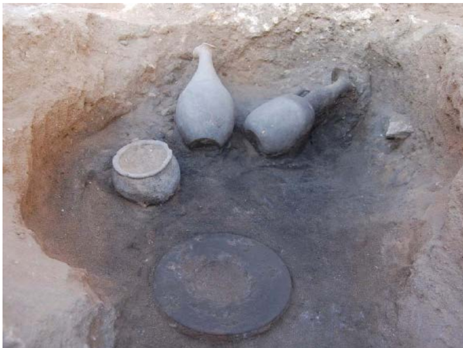
Fig. 3 - The Phoenician cremation tomb in the Tharros northern necropolis (from Del Vais, Fariselli, 2012)

The ground tombs were covered with stones or had a more accurate cover, from slabs that formed a flat surface under which the cremated body lay with its funeral items (figs 4-5).