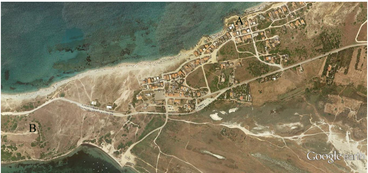
Fig. 1 - Location of the northern necropolis of Tharros. A) the necropolis; B) Su Muru Mannu hill (from Google Earth. Reprocessed by C. Tronchetti)

The Phoenician-Punic city of Tharros had two necropolis areas, one north and one south of the inhabited area. The northern necropolis, about 1 km from Su Muru Mannu, is inside the area of the current residential area of San Giovanni di Sinis, along the sea shore, and suffered damage in modern times from quarry activity (fig. 1).