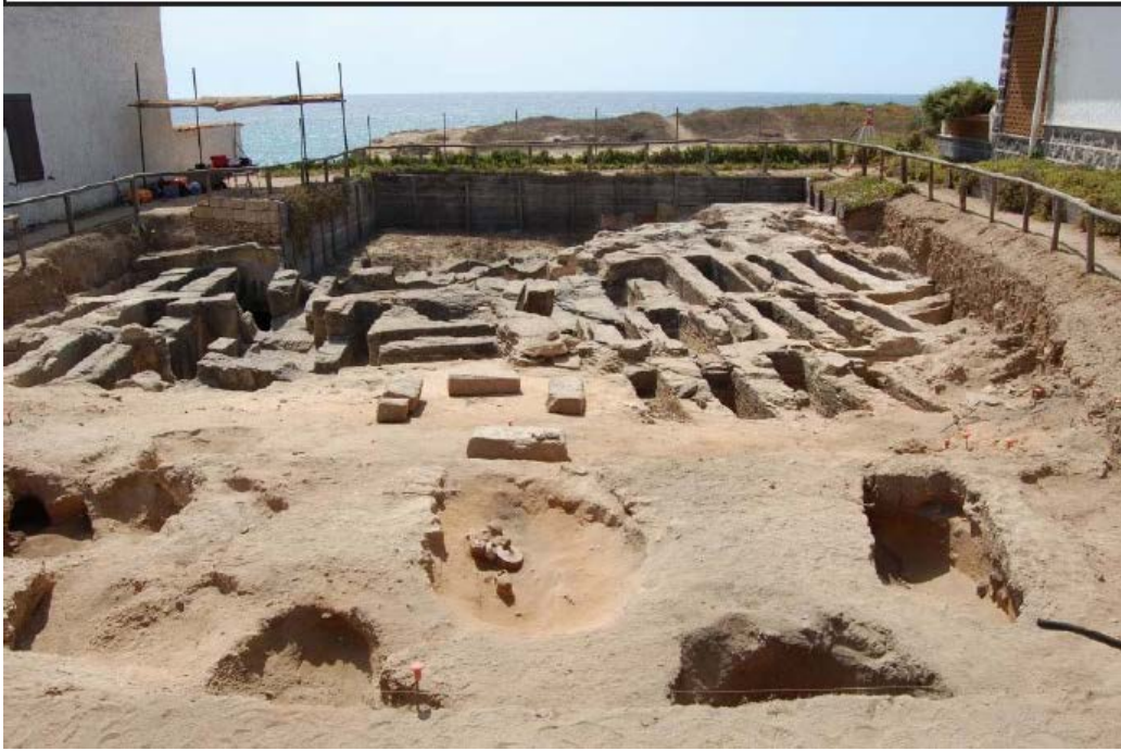
Fig. 2 - View of the northern necropolis of Tharros during excavation (from DEL VAIS, FARISELLI 2012)