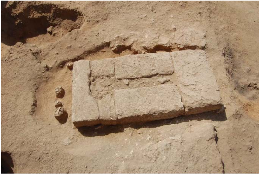
Fig. 4 - Tomb nr. 56 in the Tharros northern necropolis; stone block covering (from DEL VAIS, FARISELLI, 2012)