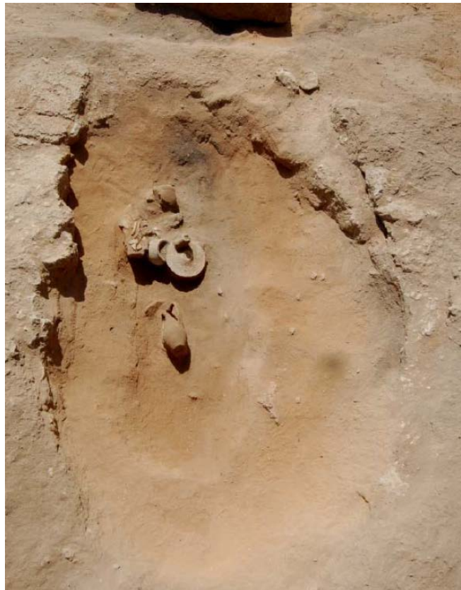
Fig. 5 - Funeral items from tomb nr. 56 (from Del Vais, Fariselli, 2012)