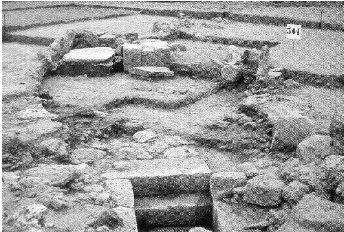
Fig. 3 - The Punic place of worship in front of the Nuragic well temple of Cuccuru S'Arriu (from DEL VAIS 2015)

The favourite locations were the countryside and the lower parts of hills, while the higher areas had a more sporadic presence, often linked with Nuragic structures being used again. The phenomenon of re-using these structures also occurred in other situations, as in the area of the Cuccuru S'Arriu temple well, where a small place of worship was built in front of it (figs. 3-4).