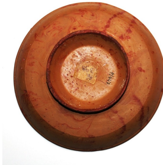
Fig. 3 - South-Gaulish marbled Samian ware (Oristano, Antiquarium Arboreense )