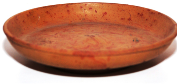
Fig. 2 - South-Gaulish marbled Samian ware (Oristano, Antiquarium Arboreense )

The plate, that probably comes from a tomb given its excellent state of preservation (figs. 2-4) is an excellent example of marbled pottery. It has a simple, functional shape, with a low base, a short oblique wall, and the flat bowl, that is raised internally in the centre, where the illegible manufacturer's stamp can be seen.