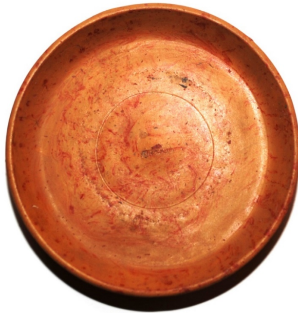
Fig. 4 - South-Gaulish marbled Samian ware (Oristano, Antiquarium Arborensis )

The shape of the vase is canonical, for both Italic red gloss sigillata ware and south-Gaulish samian ware and is off the Dragendorff type 18 (fig. 5).