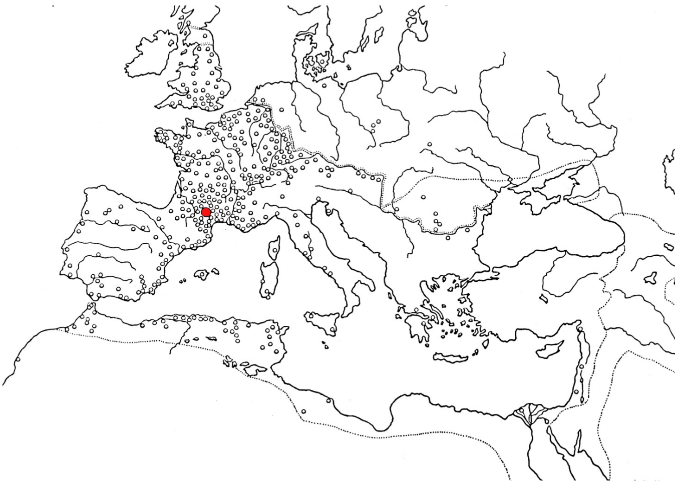
Fig. 1 - Diffusion of products from the workshops of La Graufesenque (shown in red) (from BEMONT, JACOB 1986, p. 102)

These workshops made items for the continental European market, and only products from the La Graufesenque group, near the current town of Milau, were also distributed around the Mediterranean (fig. 1).