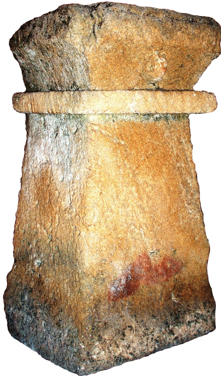
Fig. 3 - Sandstone memorial stone from the Tharros tophet (Oristano, Antiquarium Arborense )

The large memorial stones are a characteristic of the Tharros tophet, simple like in this example, and enriched with other elements in the top part. In Sardinia, Tharros is the only place that has returned them, and can be compared in other countries with Motya and Carthage (fig. 4).