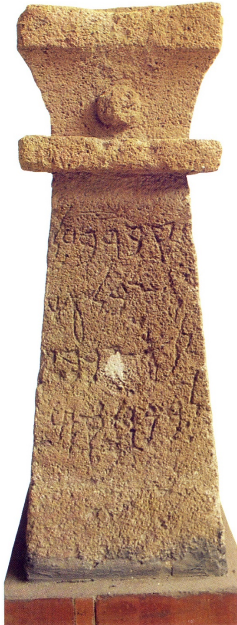
Fig. 6 - Funeral stone from Tharros from 4th century B.C. (from UBERTI 1986, p. 115)

As well as in the tophet, memorial stones were also used in the necropolises, as can be seen here, probably from the northern necropolis in Tharros, with an inscription that states "tomb of B'LZBL, wife of ZRBL, son of MQM", dated to the 4th century B.C. (fig. 6).