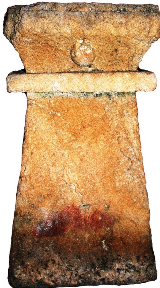
Fig. 1 - Sandstone memorial stone from the Tharros tophet (Oristano, Antiquarium Arborensis )

The sculpture shows a square stone with the lower part tapered towards the top, crowned by a jutting cornice that defines the top edge (figs. 1-3) This has an opposite direction, forming a kind of Egyptian moulding, on which the sun globe is represented as relief work. The back wall of the stone shows traces of red paint.