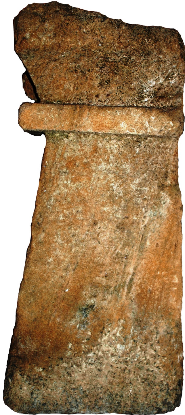
Fig. 2 - Sandstone memorial stone from the Tharros tophet (Oristano, Antiquarium Arborensis )