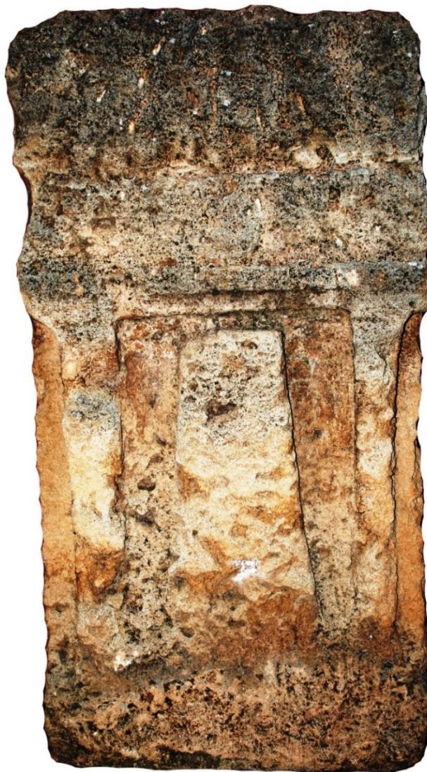
Fig. 1 - Punic stelae with baetylus from the 5th-4th century B.C. (Oristano, Antiquarium Arborensis )

One of the most common images is that of the baetylus, the sacred pillar, considered to be the gods' seat (figs. 1-3).