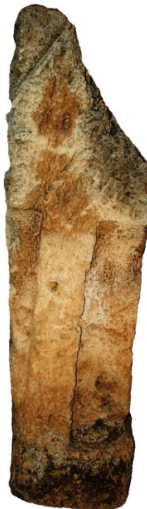
Fig. 3 - Punic stelae with baetylus from the 5th-4th century B.C. (Oristano, Antiquarium Arboreense )