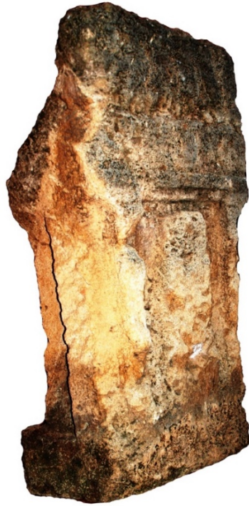
Fig. 2 - Punic stelae with baetylus from the 5th-4th century B.C. (Oristano, Antiquarium Arboreense )