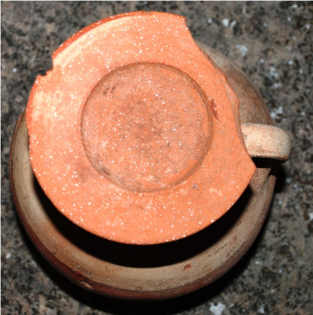
Fig. 5 The umbilicate plate covering the top of the urn (Oristano, Antiquarium Arborense )

It is not possible to provide a closer date for the pottery due to the large number preserved from Phoenician and Punic ceramic production that stayed more or less the same in shape and decoration for centuries.