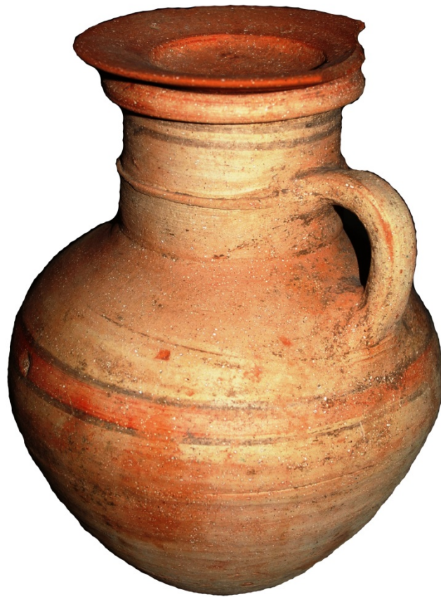
Fig. 2 - round-necked pitcher from the tophet (Oristano, Antiquarium Arborensis )

Evolution of a Phoenician shape that started in the 8th century B.C. (Fig. 3), this type of pitcher always has no feet, the round neck with the step in it, a thick, overhanging brim; it has little, if no decoration, limiting itself to one or more bands of colour on the body (fig. 4); there is no decoration in the older examples.