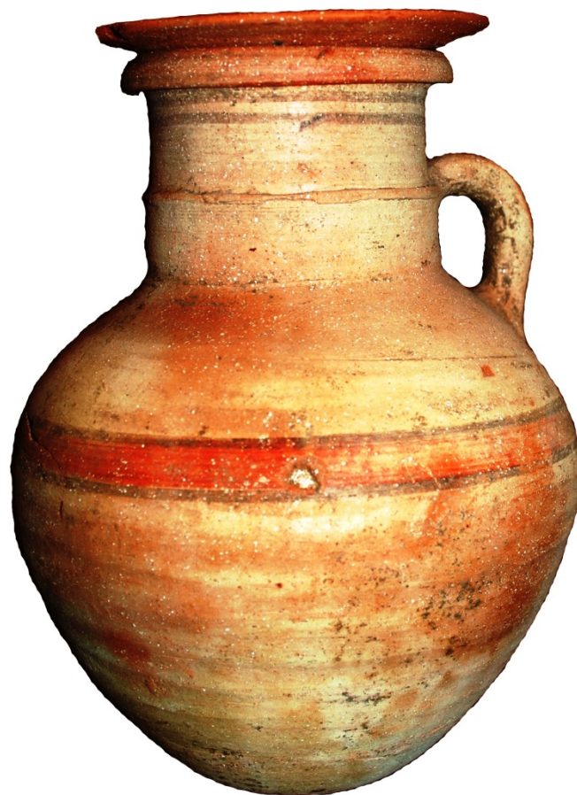
Fig. 1 - Round-necked pitcher from the tophet (Oristano, Antiquarium Arborense )

In the earlier phase, between the end of the 7th and the 5th centuries B.C., the shape most used (211 examples found in digs in 1971) was the “pitcher with the cylindrical neck, with a step halfway up the top” (figs. 1-2).