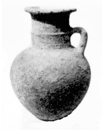
Fig. 3 - Urn from the Mozia tophet, from the mid 7th century B.C. (From CIASCA ET ALII 1973, picture XLIII, 1)